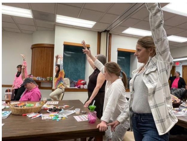
Fun and games at the Social Connection gathering